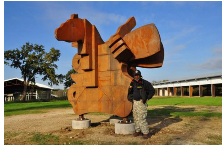
Equine Rhythm at Texas Horse Park