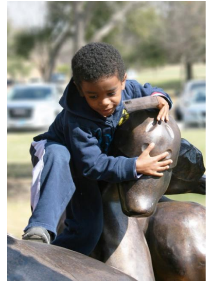
Kidd 24/7 at Kidd Springs Park