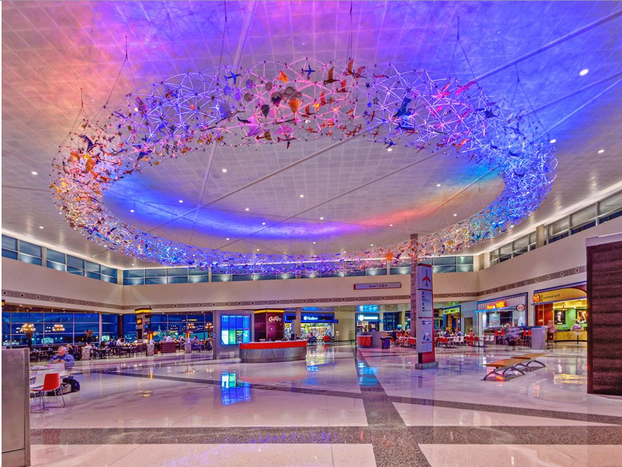
Sky at Dallas Love Field